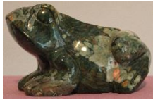
Lot 5 – Rhyolitic frog from Mt Hay, Queensland.