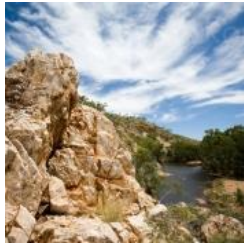
Lot 10 – Paroo Waterhole