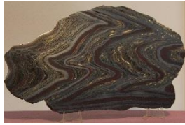
Lot 13 – Banded Iron Formation from Western Australia.