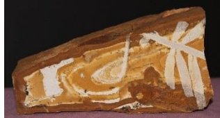
Fossil fish and plant from the Purlawaugh Formation, Talbragar, N.S.W. ~ 175 Ma