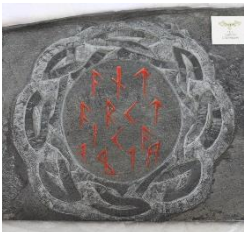
Lot 12 – Antartica 2016 carved in slate