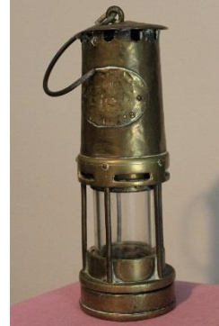
E. Thomas Williams Cambrian miners lamp from Wales. c.a. 1900.