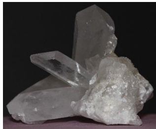
Quartz crystal cluster from U.S.A.