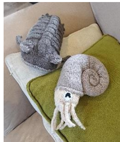
Lot 11 – Teddy Trilobite & Nautie Nicky