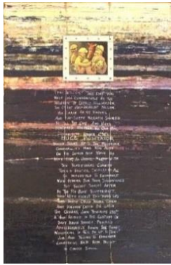
Lot 9 – The Descent , by Julie Lau.