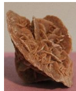
Lot 7 – Desert Rose gypsum from Saudi Arabia.