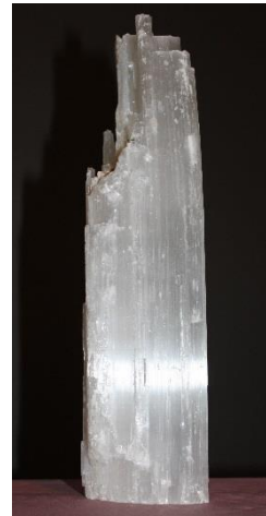
Selenite spike from Mexico.