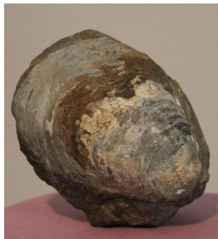
Complete bivalve mollusc from the Dalwood Formation, Allandale, N.S.W. ~ 285 Ma